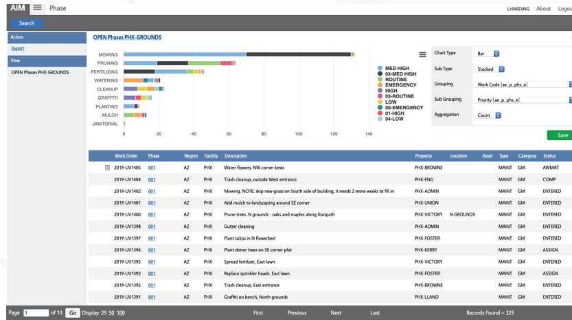
Custom Query Chart Display in AiM Search