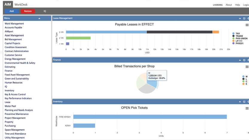
Bundled and Custom Reporting on the AiM WorkDesk